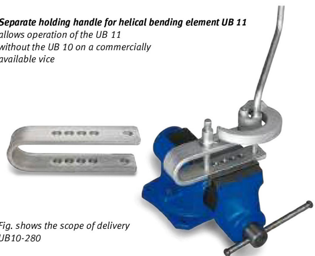
Fig. shows the scope of delivery UB10-280